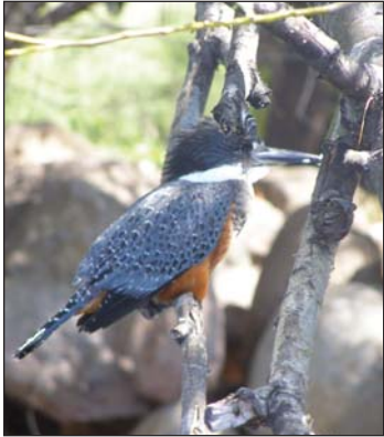
One of the Chimehuin's best fly fishers – a Kingfisher.