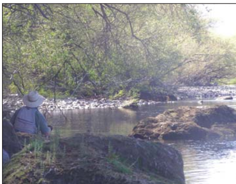
Big fish in tough water. With not much room to cast, patience is a virtue.