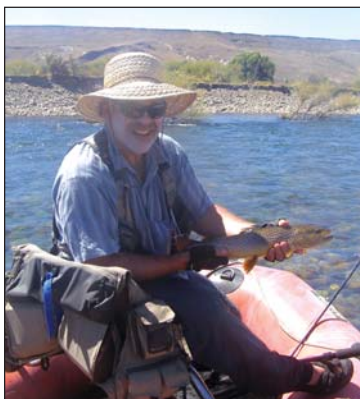
A 21" brown on Rio Chimehuin. This is the last fish we caught on the trip.

We launched just before noon and immediately had some good dry fly fishing on hoppers and beetles. When we fished the Chimehuin 2 years ago, its waters appeared gin clear. This year's drought conditions seemed to enhance algae blooms particularly downstream of the town of Junin. The low flows, hot air temperatures and warmer water temperatures were not conducive to actively feeding trout. As we floated past both Estancia wading guides and independent float fishing guides whose clients were also wade-fishing, I couldn't help but think if this were the Blackfoot they probably would have instilled mandatory afternoon fishing restrictions.