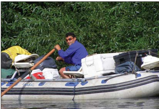
Torito, “little bull,” in the gear boat.