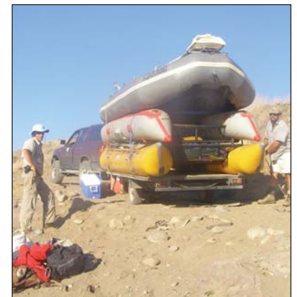
Argentine Guides loading gear at the take out. They all pitch in and help one another at the end of the float.