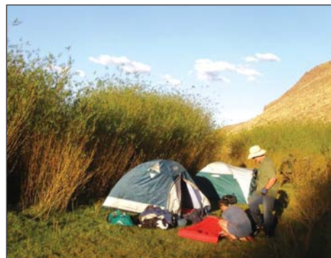
Bandido trout fishermen camp.